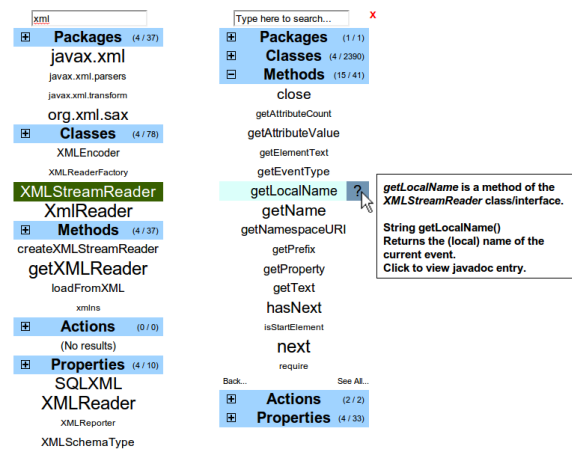
Figure 2. Demonstration of accordion expansion, text searching and informational popups.

The ability to search a column for particular keywords was added since it was a highly requested feature, allowing users to quickly jump to a particular item if they already have one or more words in mind. Filtering occurs instantaneously – the column's content adjusts with each additional keystroke, providing continuous results as the user refines the query. The search mechanism also handles multiple keywords by modifying the ranking system to reflect how