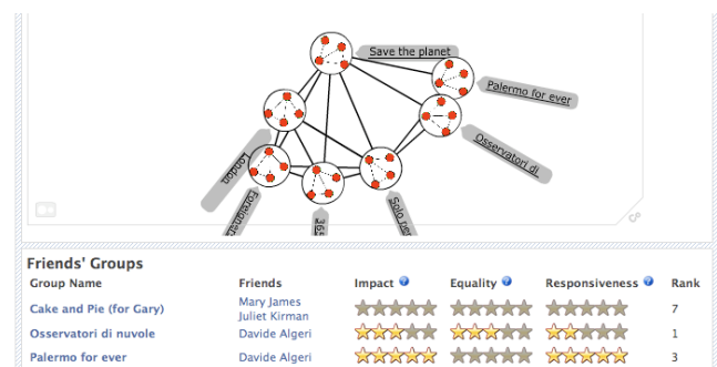
Figure 2 - Group Social Network Indices in Magpies

Additional visualisations allowed players to see activity in the form of network graphs. For example, it was possible to view the pattern of interactions between players within groups in the form of a network graph, where individuals were represented by nodes and connected by arrows. These arrows represent the act of one player contributing to the stash of another. Players could also visualise group membership by seeing a graph that represented each group as a node connected by edges indicating shared membership. This aided the players when choosing to join groups.