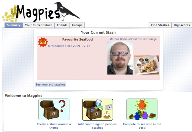
Figure 1 - Magpies Interface

and whether this would extend to activities not centred around task completion or problem solving.