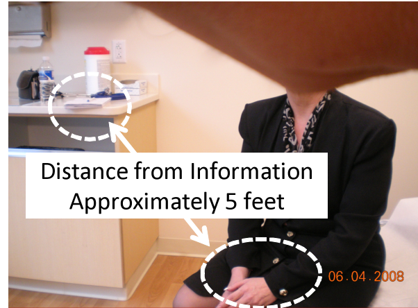
Figure 4. Retrieval from counter top