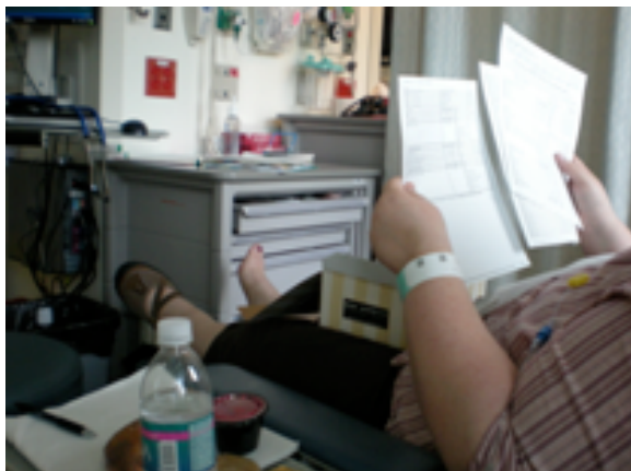
Figure 3. Reclining chair pose

The fourth pose was the ‘reclining chair pose’ (Figure 3). For example, while balancing her lunch and papers on her lap and side-tray, P13 underwent chemotherapy treatment, received and reviewed a copy of her lab results, queried her clinician about her test results, discussed emergent side effects, underwent an examination to determine extent of deterioration of her toe nails, and discussed a plan to monitor and manage the side effects with her clinicians.