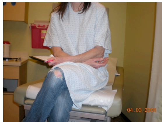
Figure 1. Upright exam table pose

While clinicians used desks and counter space to lay out their information, patients had no such space for managing their information. Consequently, they struggled to carry out their information work in awkward physical positions. We identified four ergonomic poses in which patients conducted their information work.