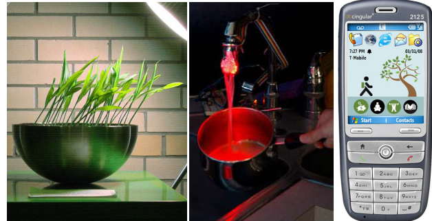
Figure 1. Examples of eco-feedback technology. (left-to-right) The Infotropism display uses sensors and living plants to provide feedback about recycling and waste disposal [29]. WaterBot provides ambient feedback information about water usage [3]. The UbiGreen Transportation Display semi-automatically senses and feeds back information about transportation to encourage green transit [19].

Copyright 2010 ACM 978-1-60558-929-9/10/04...$10.00.