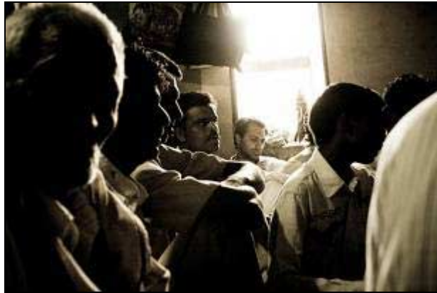
Figure 3: A house concert where more than 40 people are gathered in a small indoor setting.

propagating messages of awareness and empowerment, especially directed towards women and children. Folk traditions involve the singing of spiritual poetry, which provides a code of ethics for singers and listeners alike to live their lives and educate their children. As a spiritual practice, many villagers listen to folk music daily and at home. This has been facilitated by the advent of modern recording and playback technology.