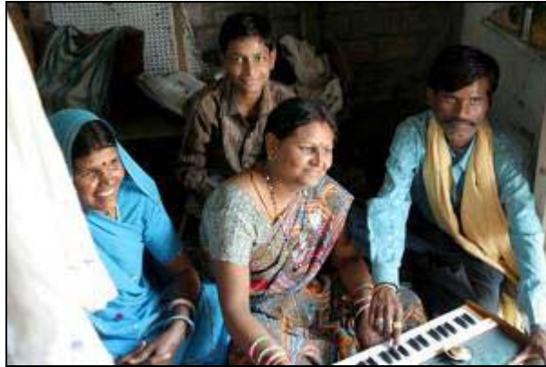
Figure 2: Women perform as well, though more occasionally than male artists.

Other participant observations included one small and one large concert setting. The former was organized in a house with approx. forty villagers gathered around to hear 8-10 artist groups perform in succession. The latter was organized in a large tent outdoors and included a night of performances by various performers/groups. While the former type of gathering is more frequent, these are attended primarily by local villagers and last generally only a couple of hours. At the larger gatherings, villagers attend from far and wide and spend almost twenty-four hours at a stretch listening to music.