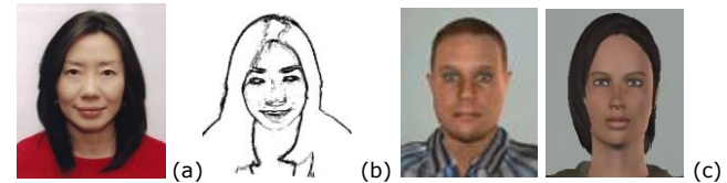
Figure 1. (a) a raw video; (b) a degraded (edge-detector filtered) video; (c) virtual humans (Rapport Agents: male & female)

detector filter. To allow video chat conversation, video conference software (Skype) was used.