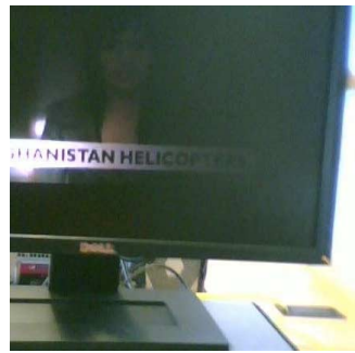
(b) Video on an LCD screen