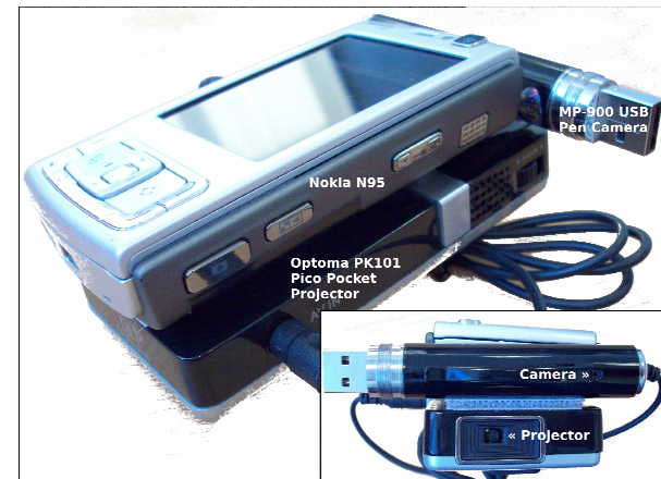
Figure 1: Prototype projector phone, where the projector and pen video camera face the same direction.

Most existing work, generally using simulated hand-held projections, has focused on individuals projecting and augmenting their physical environments. Beardsley et al. , for example, studied the augmentation of physical environments using small desktop projectors mounted on a one-handed joystick [1]. Sugimoto et al. took a different approach, using a static projector to simulate mobile projections. Their work investigated annotation, manipulation, and file-transfer techniques, using overlapping projections [10]. Later, after creating and studying a more portable handheld projection prototype [2], Cao et al. investigated multi-user projection scenarios, such as games and business meetings, by enabling techniques like the joining of two projections, and the augmentation of one projection with another [3]. Hang et al. performed an empirical study of map-based tasks using a mobile phone strapped to a small desktop projector [6]. The projector