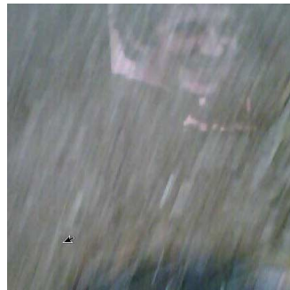
(a) Photo on the ground