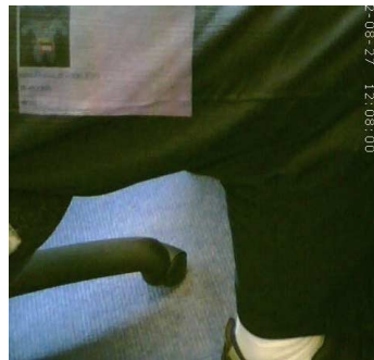
(c) Website on a person's leg