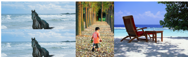
Figure 1. Sample images in each category

Sixty digital images were selected from search results using public search engines such as Google. Criteria to select images were 1) photo of real-life objects; 2) there is no language or cultural iconic content in the image; 3) the image contained at least one clear foreground main object and a number of distinguishable background objects; 4) the main object belonged to one of the three categories: human, animal, and still objects; and 4) for a good proportion of the